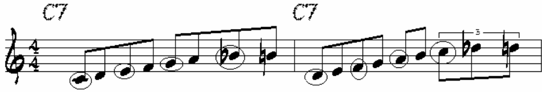
Figure 2. Chord tones on strong beats (measure 1) and not on strong beats (measure