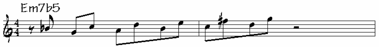
Figure 6. Solo over Em7b5