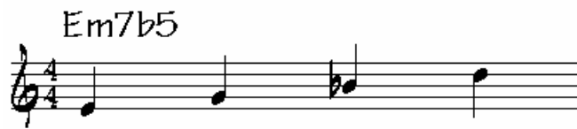
Figure 5. Em7b5