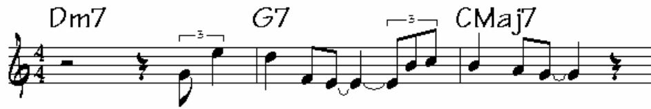
Figure 4. Solo #2