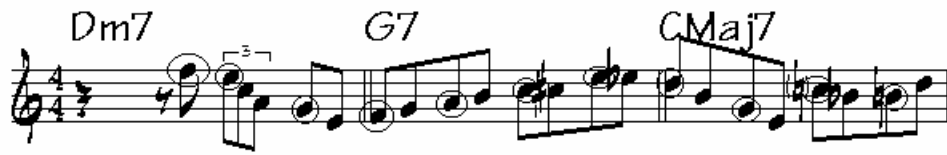
Figure 3. Solo #1